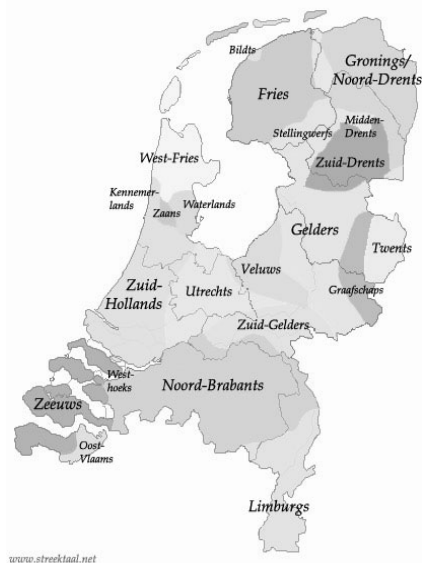
Figure 1. Dialect distribution in the Netherlands